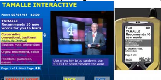
Figure 4: Scaffolding difficult language item

down the list, while the Select key allows adding a chosen word to a learner's personal sphere. On the mobile interface, a selected word is highlighted and could be added by pressing the handset's select key.