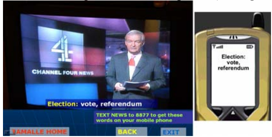
Figure 3: Just-in-time scaffolding

5.2.1. Just-in-time scaffolding. The system provides just-in-time help for difficult cultural or language items as they appear in the programme. By pressing "Words in Action" from the TAMALLE main menu the just-intime support will be activated providing textual annotation similar to subtitles on the television screen. The individual items may explicate a word (e.g. Tory = Conservative) or identify a scene or individual (This is 10 Downing St – the Prime Minister's residence). The reason that our design locates the call-to-action dialogue on the iTV side rather than the phone is due to the fact that this just-in-time scaffolding will be only beneficial during the programme show time and not before and after. However, a mobile can augment justin-time support while watching with other fellow viewers who may not be interested in learning a language. The learner may not want to impose annotations on everyone in the room. In this case, they can send a text message to service whose number is displayed briefly on the television screen to get just-intime scaffolding on their mobile phone (see Figure 3).