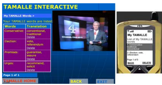
Figure 6: Managing personal learning sphere