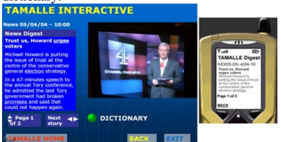
Figure 5: Scaffolding overall understanding

This is augmented by an on-screen dictionary. In the following screenshot, a news digest is provided on the left hand side of TAMALLE iTV application, activated by the green button on the remote control. The mobile phone version also provides a link to a programme summary that can be accessible before, during or after the show and on move. Again this is augmented by a dictionary.