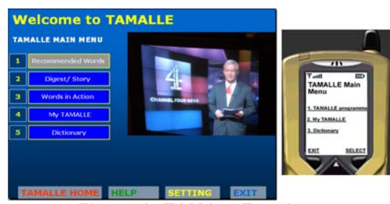
Figure 2: TAMALLE main menu

5.2.1. Just-in-time scaffolding. The system provides just-in-time help for difficult cultural or language items as they appear in the programme. By pressing "Words in Action" from the TAMALLE main menu the just-intime support will be activated providing textual annotation similar to subtitles on the television screen. The individual items may explicate a word (e.g. Tory = Conservative) or identify a scene or individual (This is 10 Downing St – the Prime Minister's residence). The reason that our design locates the call-to-action dialogue on the iTV side rather than the phone is due to the fact that this just-in-time scaffolding will be only beneficial during the programme show time and not before and after. However, a mobile can augment justin-time support while watching with other fellow viewers who may not be interested in learning a language. The learner may not want to impose annotations on everyone in the room. In this case, they can send a text message to service whose number is displayed briefly on the television screen to get just-intime scaffolding on their mobile phone (see Figure 3).